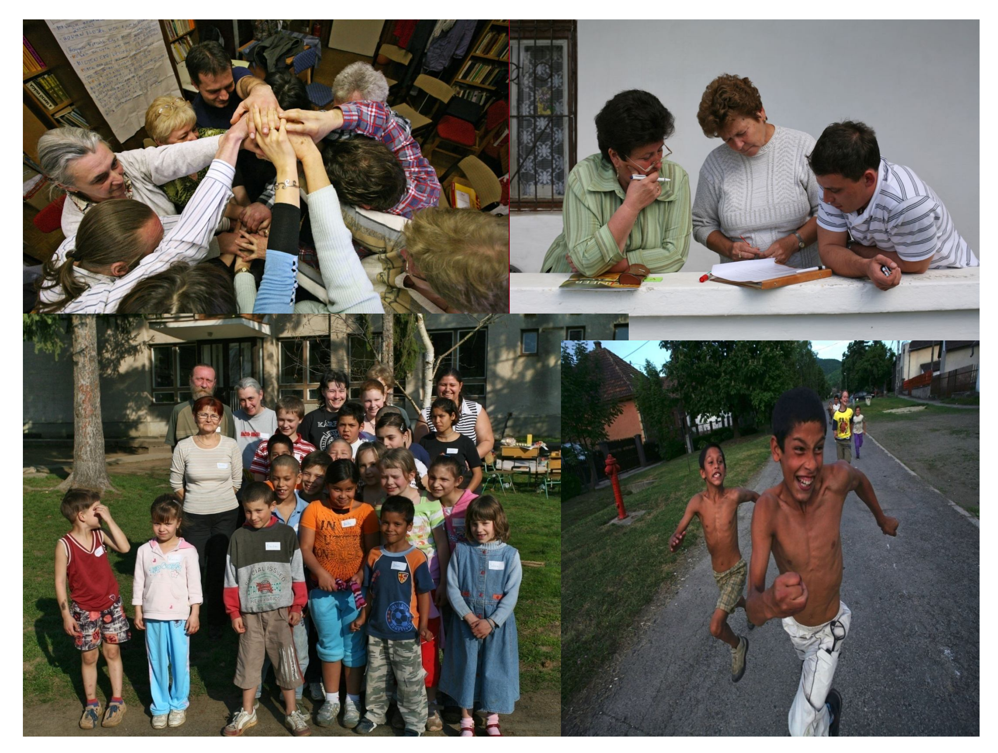
Create PDF files without this message by purchasing novaPDF printer (http://www.novapdf.com)