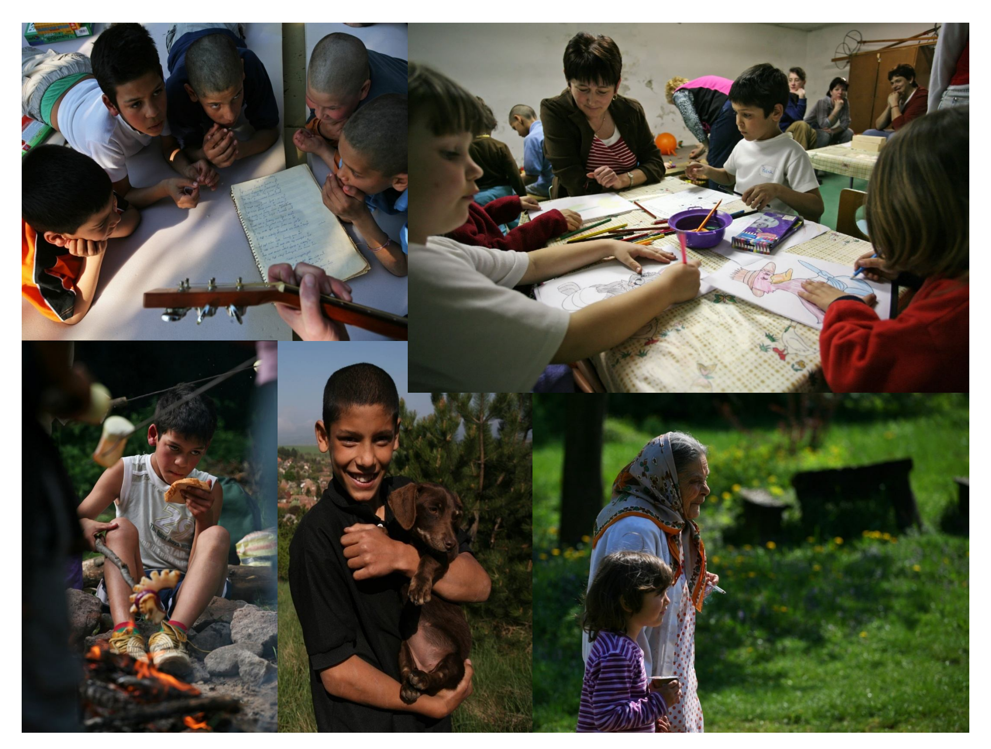
<u>Create PDF</u> files without this message by purchasing novaPDF printer (<a href="http://www.novapdf.com">http://www.novapdf.com</a>)